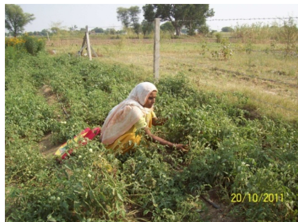
Fig. 2. Bucket kit in bottle gourd, ridge gourd and other vegetables